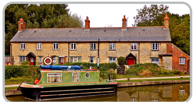
▲ Quaint canal-side cottages in Kidlington