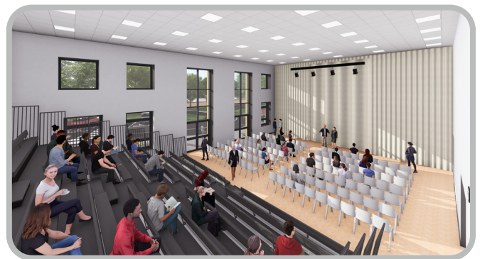
▲ CGI of proposed Main Hall

If you'd like to find out more information about this exciting project, there is a project website ( www.gosfordhillplans.co.uk ) where you can register for updates and review the plans in more detail.