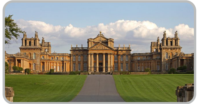
▲ The spectacular Blenheim Palace