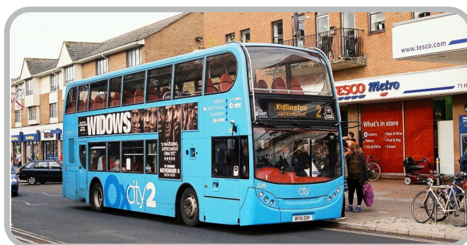
▲ Kidlington boasts excellent regular bus services