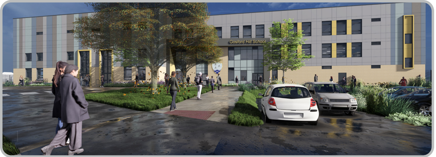
▲ An artist's impression of the entrance to our brand new school

Last year, we were delighted to share the exciting news that Gosford Hill School is on phase three of the Department for Education Schools Rebuilding Programme. Our brand new purpose built school building will be constructed on our existing site and will be phased over three years to enable the school to be operational throughout the build. We are the first school in Oxfordshire to be on the programme.