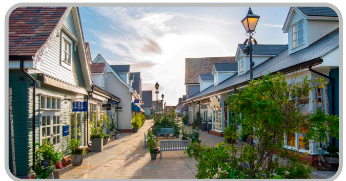
▲ Shopping at Bicester Village