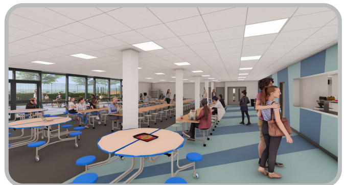
▲ Artist's impression of Dining Hall