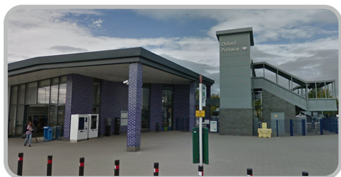
▲ Only 50 minutes to London from Oxford Parkway

Kidlington is a 46 mile journey from Heathrow Airport, 67 miles to Luton, 84 miles to Gatwick, and 60 miles to Birmingham Airport.