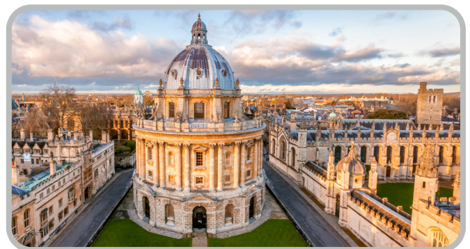
▲ The historical City of Oxford