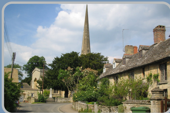
▲ Church Street, Old Kidlington

Gosford Hill School is situated in the 'village' of Kidlington, on the north western edge of the university town of Oxford, and holds the accolade of being the largest village in Europe. Kidlington is 5 miles from Oxford centre, and 7 miles from Bicester, to the north. It is at the gateway to the Cotswolds, an area of outstanding natural beauty, to the west.